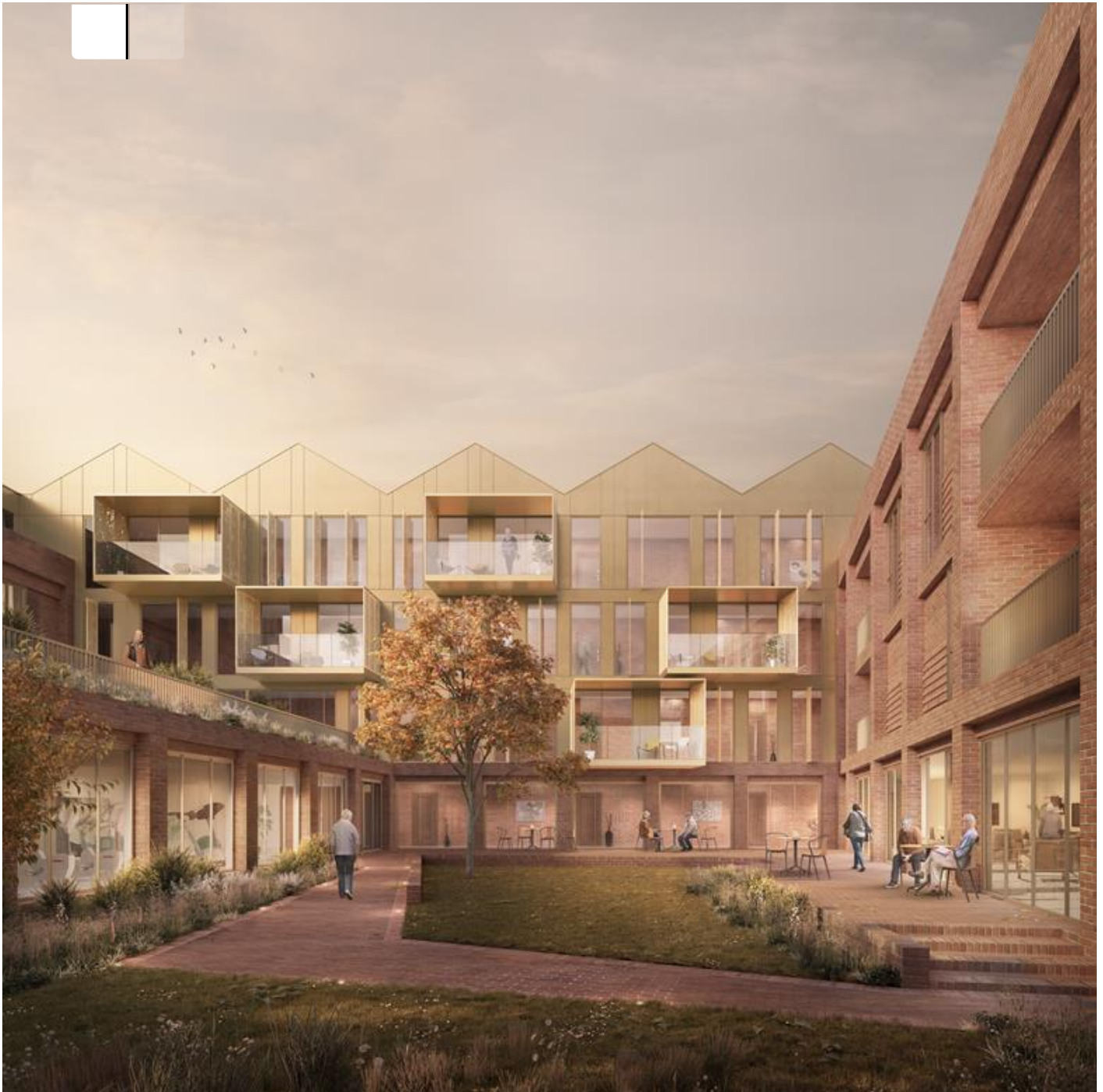
Ayre Chamberlain Gaunt's proposals for retirement housing in Bartholomew Street, Newbury

Ayre Chamberlain Gaunt, which has its main office in Basingstoke, Hampshire, is BD's Young Architect of the Year 2017.